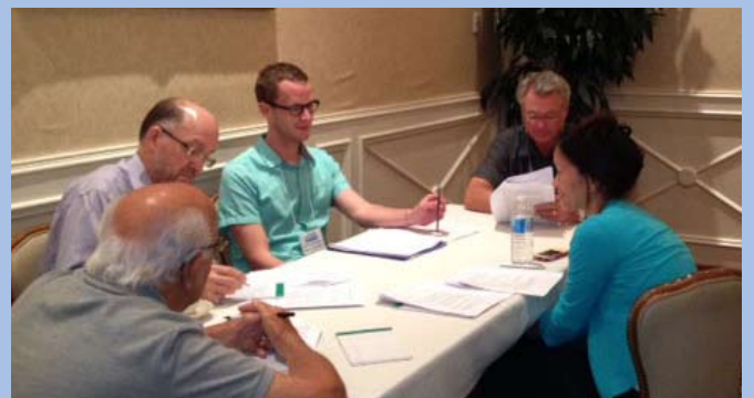
ACLU of South Carolina Board members at work.

Your financial contributions make it possible for the ACLU of South Carolina to protect the civil liberties of the most vulnerable South Carolinians and to insure that our advocacy, public education, legislative and pro-bono litigation programs will continue to protect all of us.